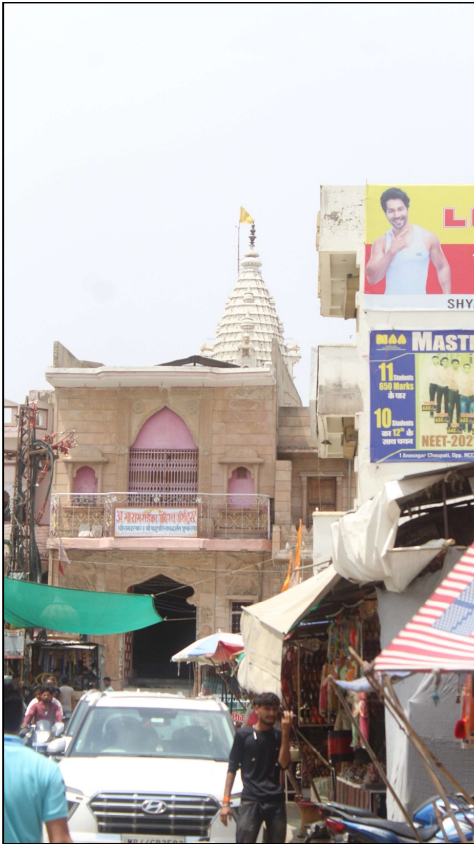
Odisha Delegates visiting Brahma Temple in Pushkar