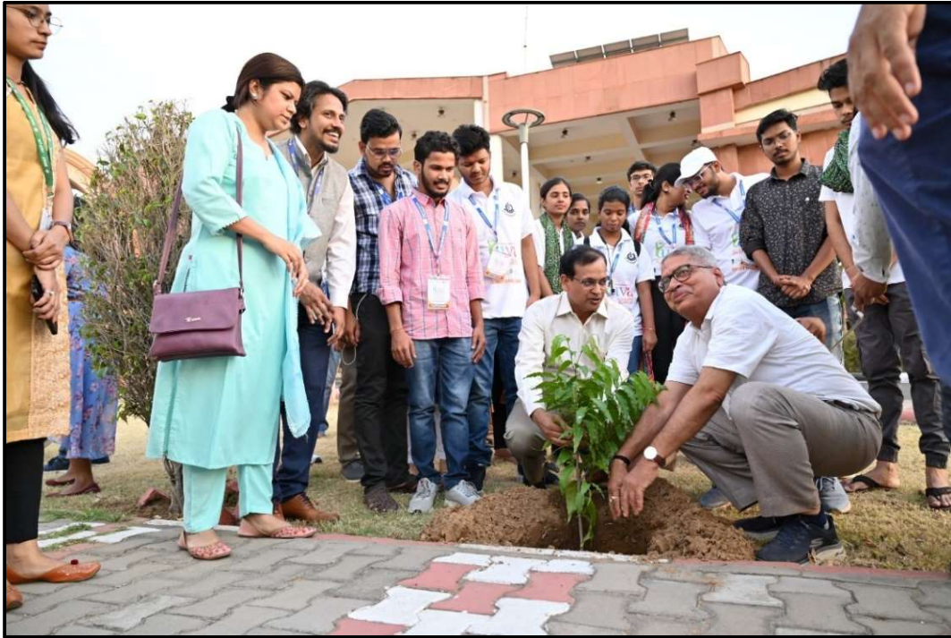
Plantation Activity being conducted by the Odisha Delegates and MNIT Jaipur team