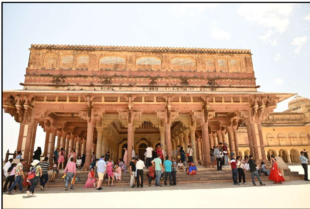
Odisha Delegates visiting Amber Fort, Jaipur