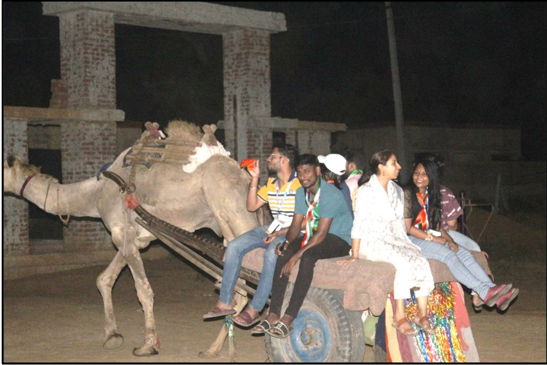
Odisha Delegates visiting Bhurthal Village