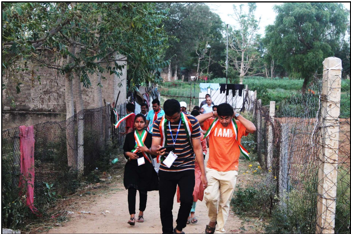
Odisha Delegates visiting Bhurthal Village