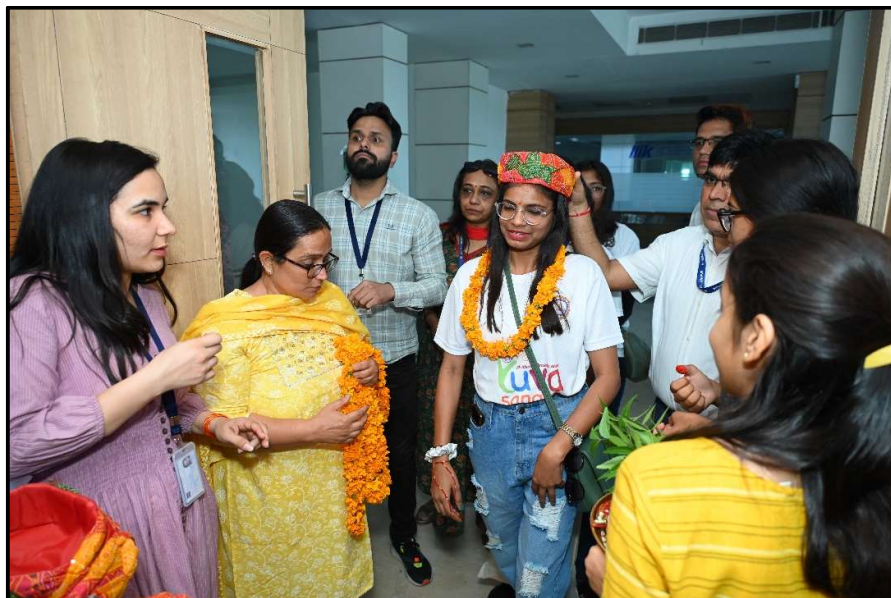
Rajasthani delegates being welcomed at MNIT Jaipur

During the visit, the students got a chance to meet the Hon'ble Governor of Odisha followed by a visit to Raghurajpur Village, Konark Temple, Chandrabhaga beach, Dhauligiri, Khandagiri Caves, Akamra Haat and Shopping complex, State Tribal Museum, Paradeep Port, Lalitgiri Monastery and Museum etc. Their itinerary also included a visit to local villages under Unnat Bharat Abhiyan and interaction with start-ups and MSME, entrepreneurs, artists, singers, sports persons, musicians, SHGs, etc.