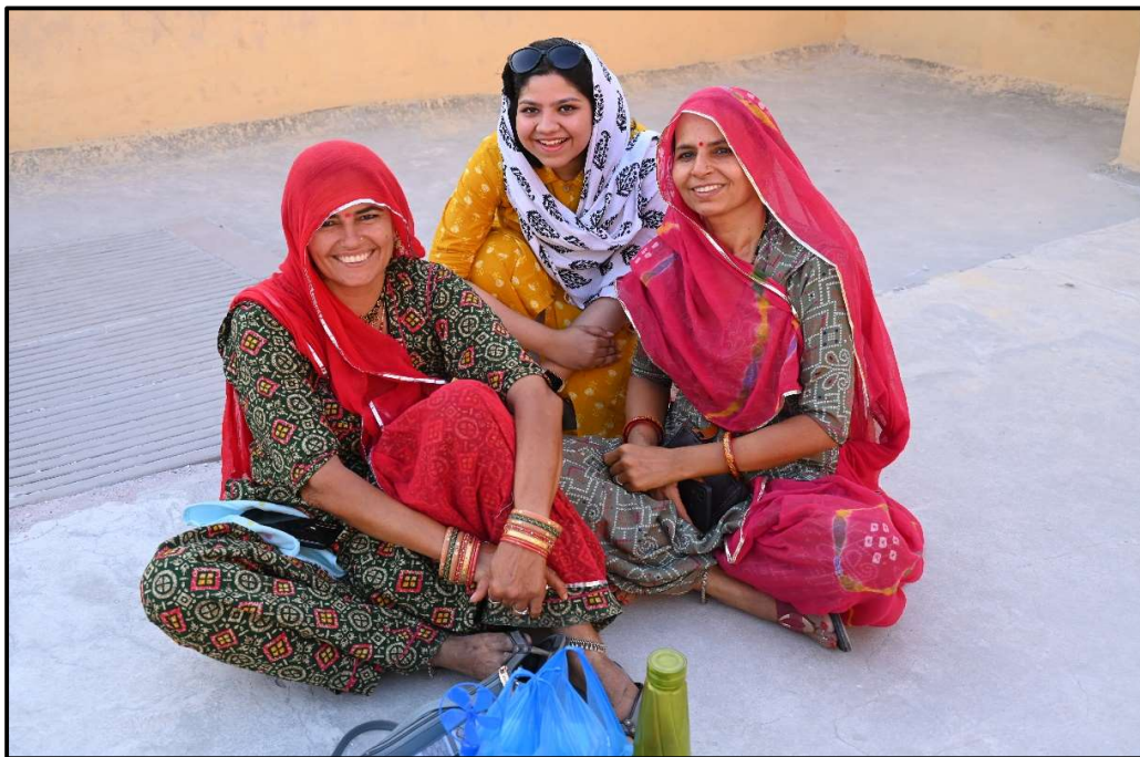
Odisha Delegate interacting with local craftsmen/people of Rajasthan