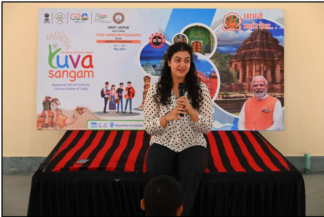
Art of Living Expert in Wellness Session addressing Odisha Delegates