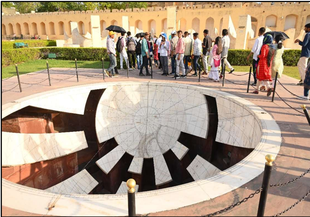
Odisha Delegates visiting Jantar Mantar, Jaipur