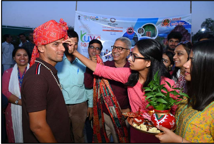
Welcome of Odisha delegates by MNIT Jaipur