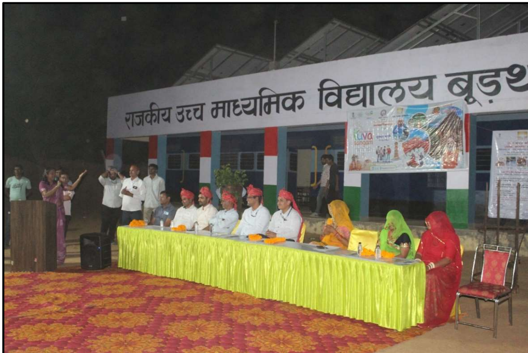
Odisha Delegates visiting Bhurthal Village