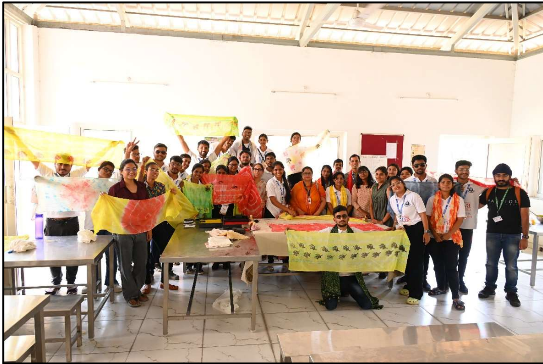
Odisha Delegates in Hands-on workshop of Tie and Dye and Block Printing with Expert at MNIT Jaipur