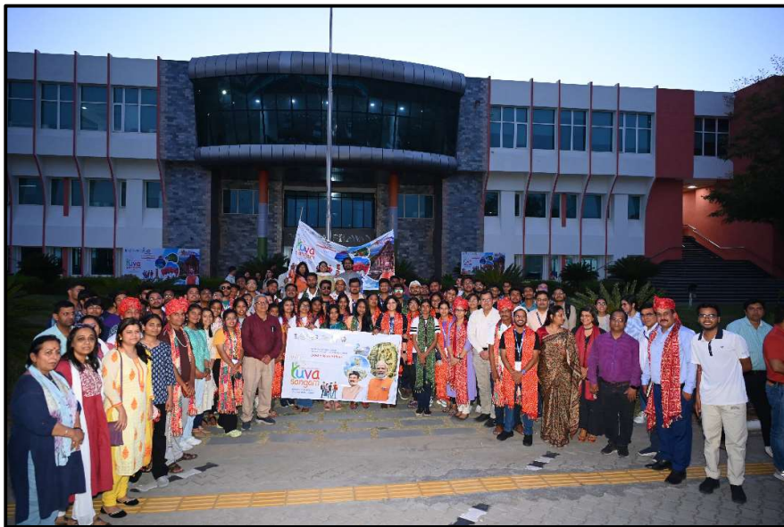
Welcome of Odisha delegates by MNIT Jaipur