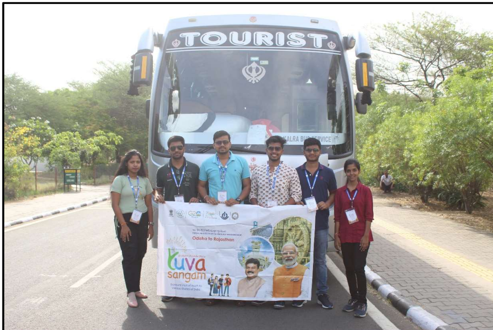
Odisha Delegates on the way to Udaipur

On 14th May morning, the Odisha delegation left for Udaipur in the morning. They visited the Brahma temple in Pushkar on the way where they were provided with a deeper understanding of the cultural and spiritual diversity of Rajasthan. Brahma Temple, Pushkar (also known as Jagatpita Brahma Mandir) is a Hindu temple situated at Pushkar, close to the sacred Pushkar Lake to which its legend has an indelible link. The temple is one of very few existing temples dedicated to the Hindu creator-god Brahma in India and remains the most prominent among them. Post trip to Pushkar, the team left for Udaipur to explore the vibrant heritage and cultural Legacy. The students stayed in the Maharana Pratap University of Agriculture and Technology, Udaipur.