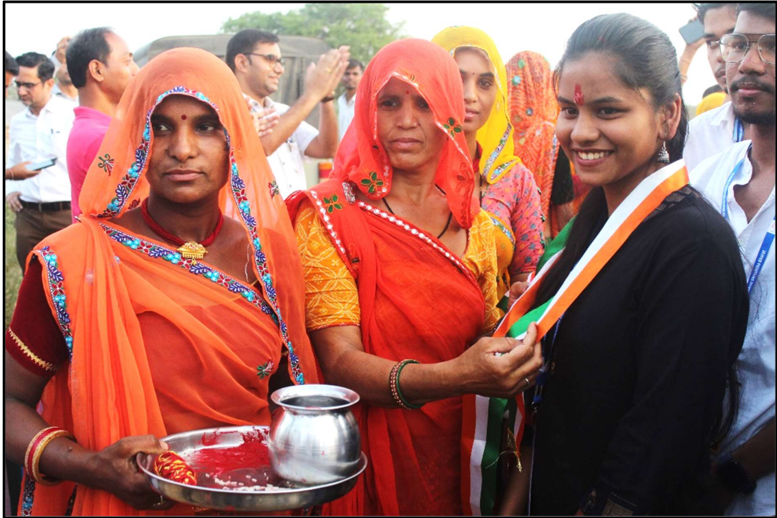
MNIT's UBA Village Bhurthal residents welcoming Odisha Delegates