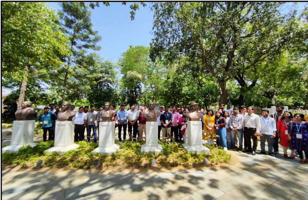
Odisha Delegates and MNIT Jaipur team at the Governor House