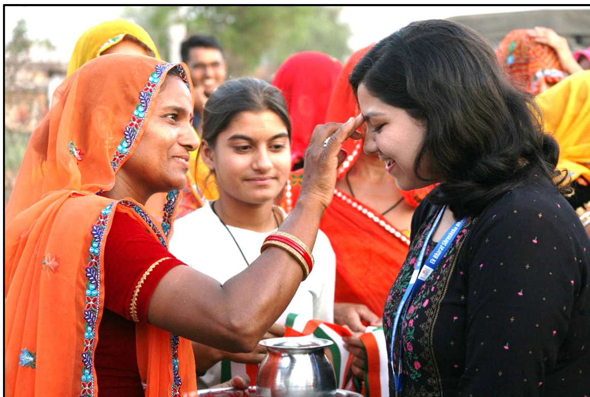
MNIT's UBA Village Bhurthal residents welcoming Odisha Delegates