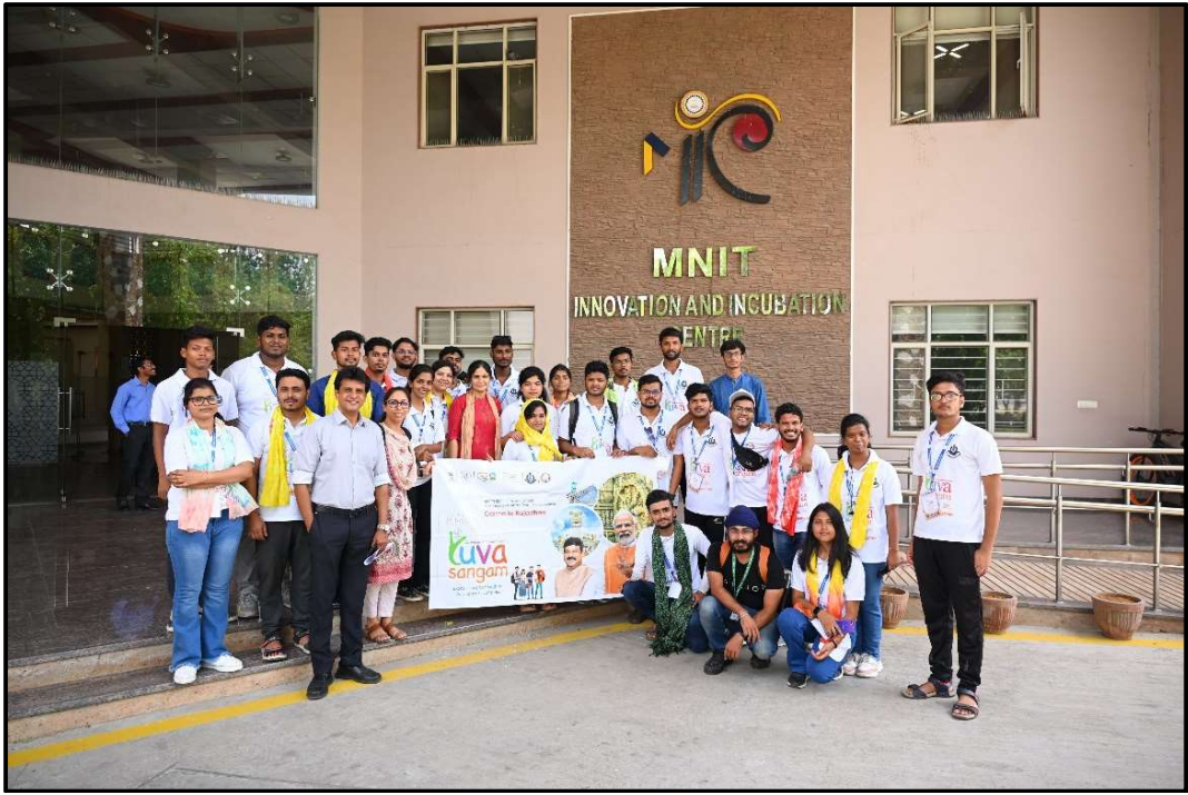
Odisha Delegates at MNIT Innovation and Incubation Centre