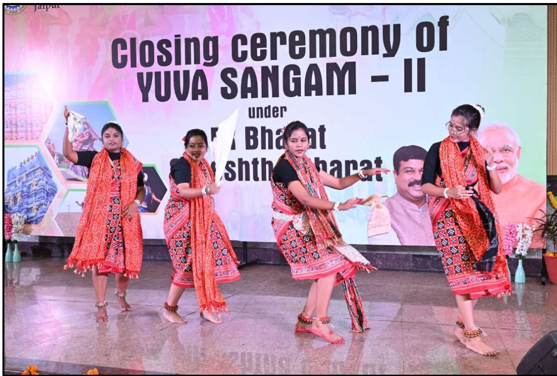
Odisha delegates performing at Closing Ceremony