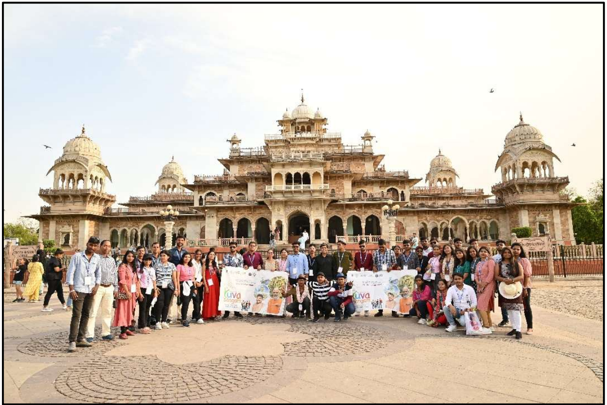
Odisha Delegates visiting Albert Hall Museum, Jaipur