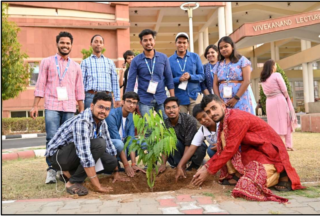
Plantation Activity being conducted by the Odisha Delegates