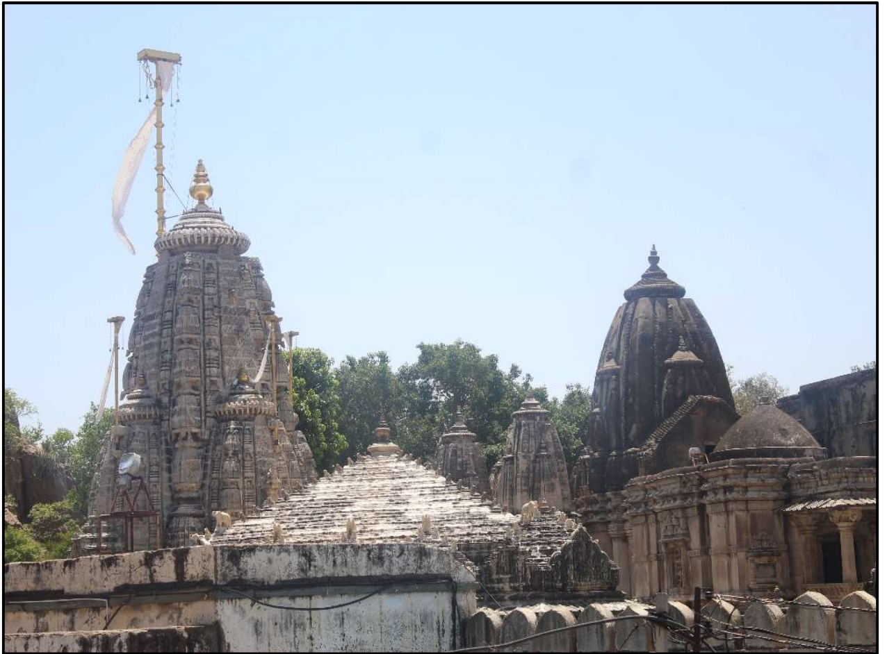
Odisha Delegates visiting Shri Ek Ling ji Temple, Udaipur