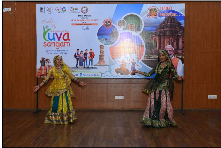
Welcome Ceremony for Odisha delegates at MNIT Jaipur