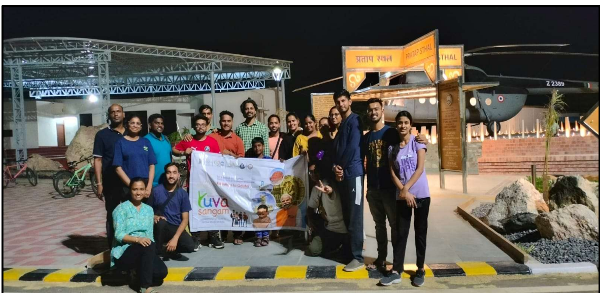
Arrival of Rajasthani delegates at MNIT Jaipur campus