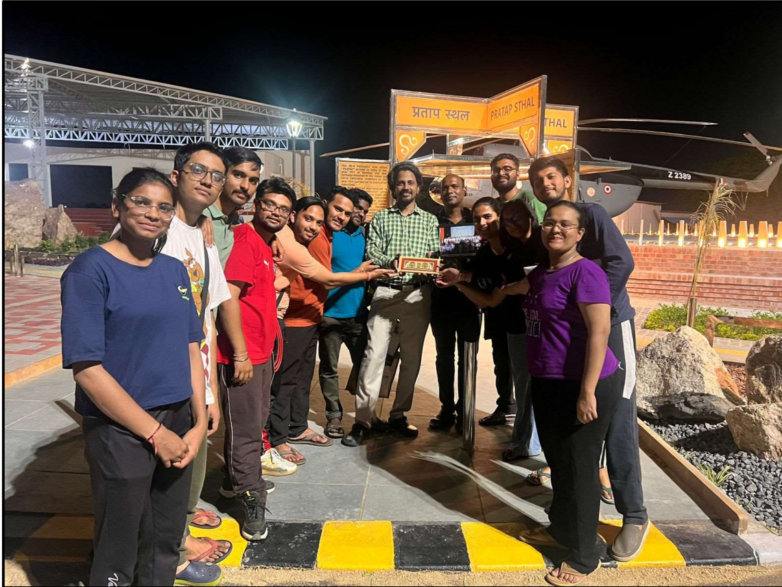
Arrival of Rajasthani delegates at MNIT Jaipur campus

The Rajasthani delegates arrived in the MNIT Jaipur Campus at 08:30 pm on 23.05.2023 after travelling for more than 1 day from IIT Bhubaneswar with life long memories of their tour in Odisha. They stayed and spent time in the campus till they departed to their respective hometowns.