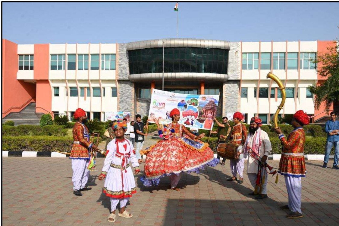
Folk dance during Flag Off ceremony