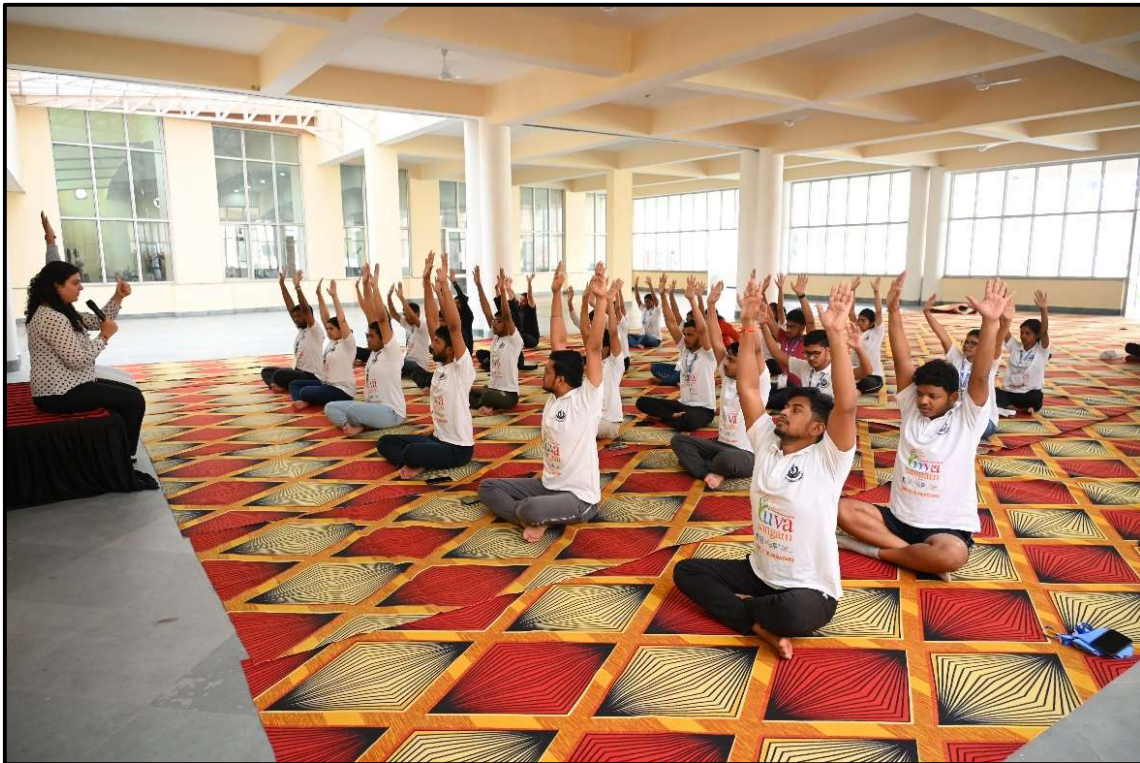
Odisha Delegates in Wellness Session at MNIT Jaipur

The internationally renowned Rajasthani Folk Artists Group "Appanath Kalbelia Group" from Jodhpur, Rajasthan, also gave a cultural performance with folk songs and dances from Rajasthan during the Closing Ceremony. The dinner offered was a fusion of dishes from Odisha, Rajasthan and Millets under the International Year of Millets 2023.