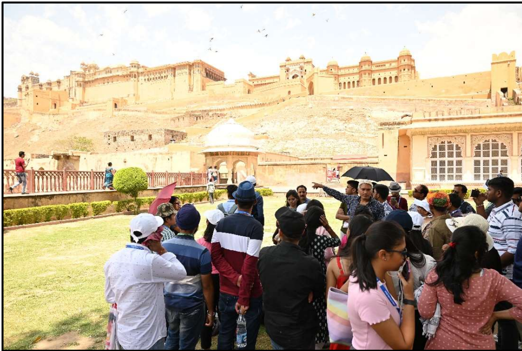
Odisha Delegates visiting Amber Fort, Jaipur

Students shared their experiences and expressed their gratitude to the Government of India for providing them with this once-in-a-lifetime opportunity. They also again went to the walled city during evening hours where they also interacted with the locals along with engaging in shopping. During their week-long visit, students will visit different places and will experience various facets of art, culture, life, and landmarks in the state of Rajasthan.