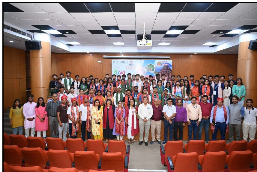
Welcome Ceremony for Odisha delegates at MNIT Jaipur