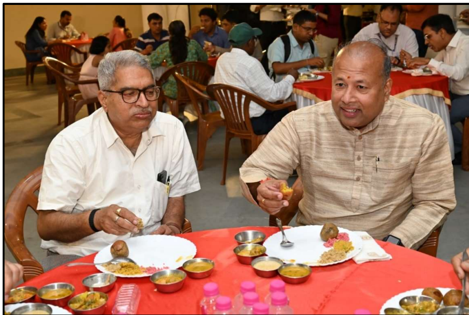
Dinner of Rajasthan, Odisha and Millets served at Closing Ceremony