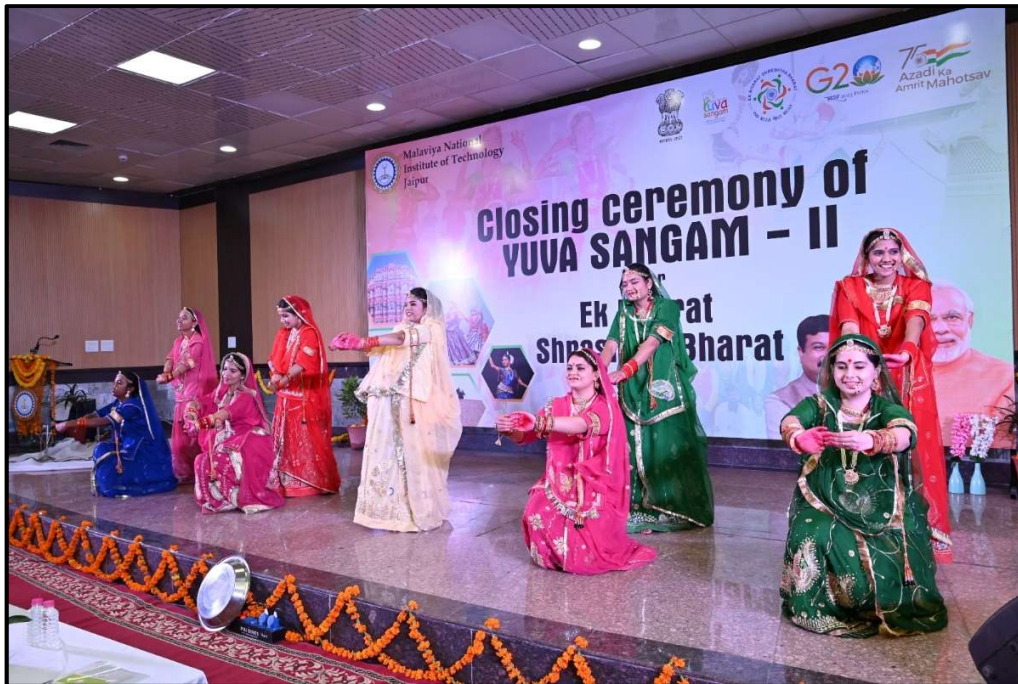
MNIT Jaipur students performing at Closing Ceremony