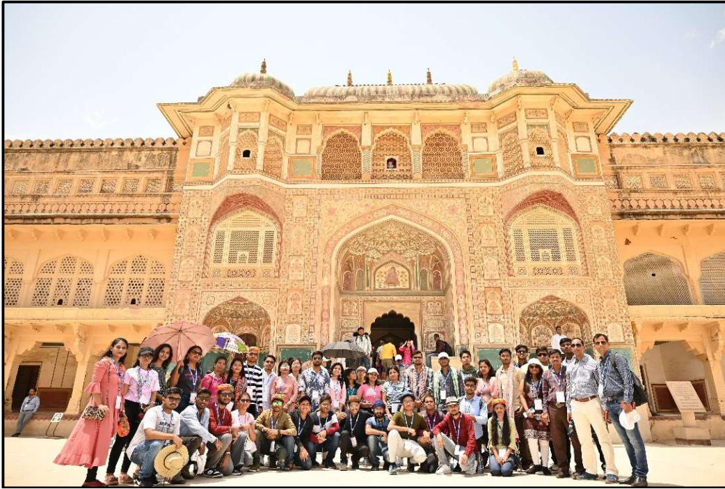
Odisha Delegates visiting Amber Fort, Jaipur