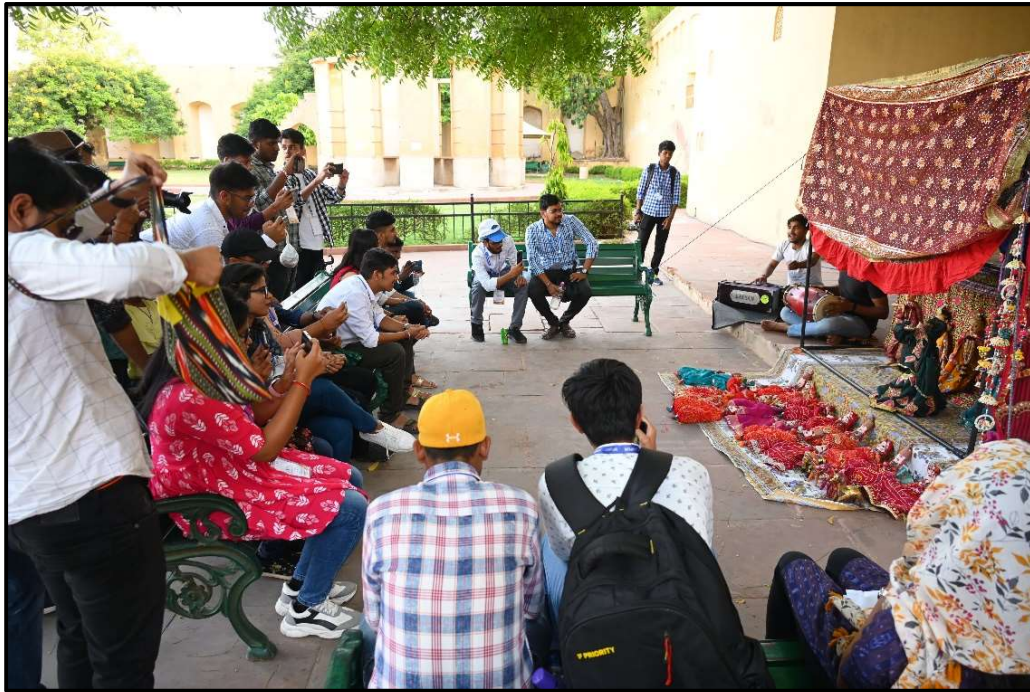
Odisha Delegates watching Kathputli show at City Palace, Jaipur