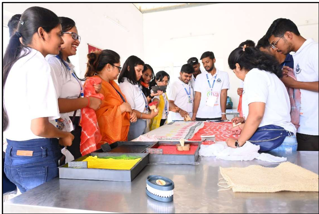
Odisha Delegates in Hands-on workshop of Tie and Dye and Block Printing with Expert at MNIT Jaipur