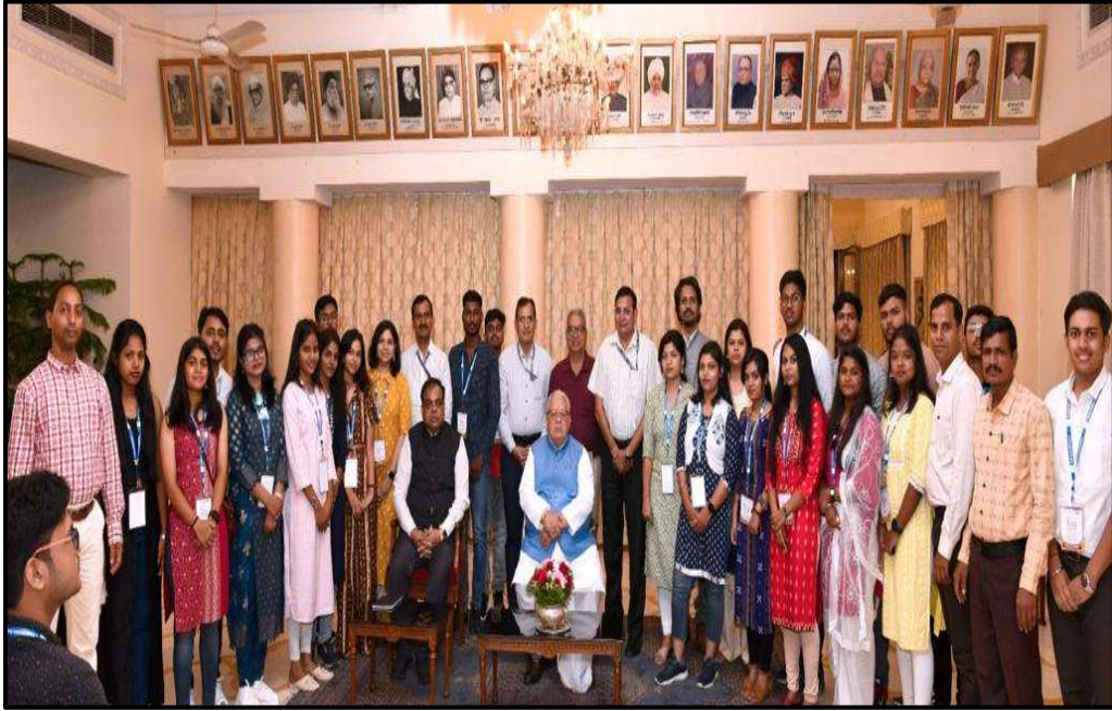
Odisha Delegates and MNIT Jaipur team with the Hon'ble Governor Sh. Kalraj Mishra