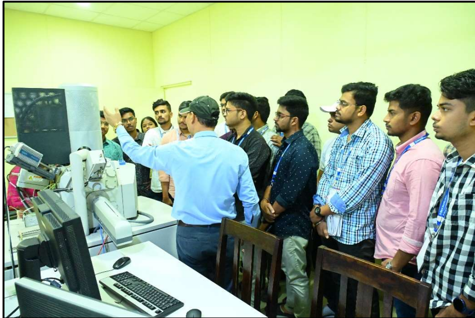
Odisha delegates at the Materials Research Centre, MNIT Jaipur