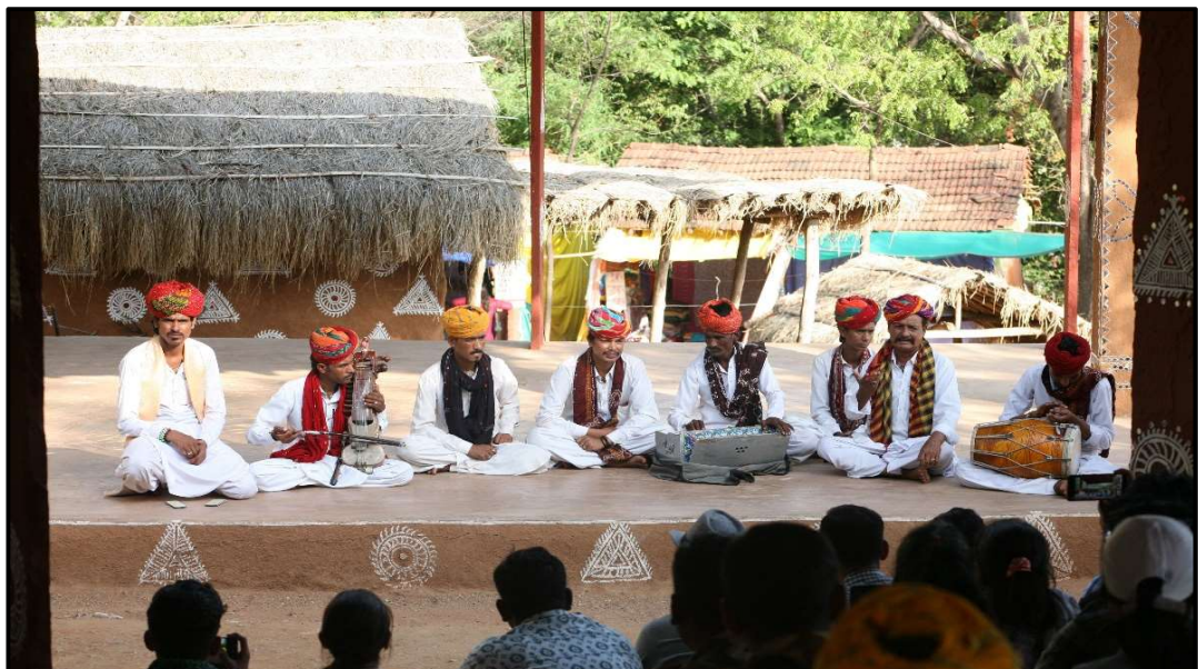
Odisha Delegates visiting Shilpgram, Udaipur

The visit to the sites in Udaipur were supported by the West Zone Cultural Centre, Udaipur. The delegates were awe-struck by the adorned intricate carvings and rich heritage of Udaipur City.