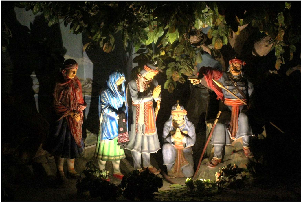
Odisha Delegates visiting Maharana Pratap Gaurav Kendra, Udaipur